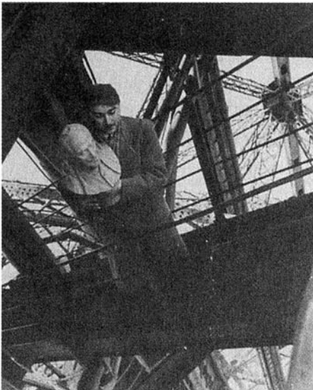
Bust of Franklin carried to the top of the Eiffel Tower

I would also add that this also demonstrates the benefits, for the entire world, of a real dialogue between France and the United States!