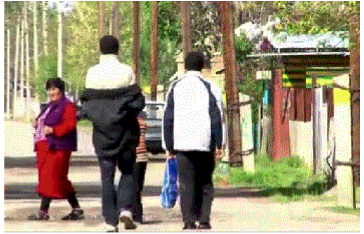
Tokmok, Kyrgyz: early Tsarnaev home