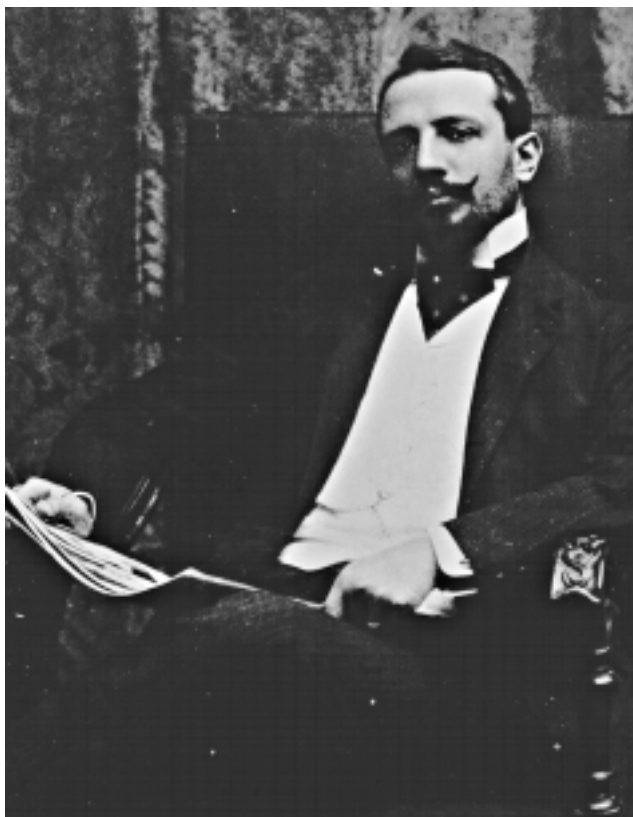
Count Giuseppe Volpi di Misurata, head of the “Venetian group” in Italian politics and industry, was Mussolini’s Finance Minister. He emphasized that corporatist economic organization was “the most characteristic achievement of the Fascist regime.”