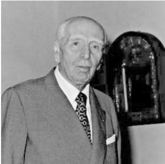
Count Vittorio Cini, a Venetian oligarch and former minister in Mussolini's Cabinet, opened the doors for Ledeen to the ultra-secret freemasonic archives in Rome and Venice.

contains both a well defined theory of human progress and a conception of the popular will that ties it to the extremist Rousseauvian themes of the Terror and the 'totalitarian democracy' that it spawned."