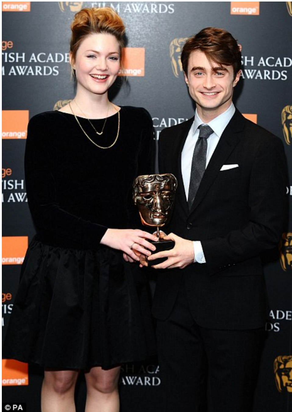
Holliday Grainger and Daniel Radcliffe at a photocall for the Bafta Awards nominations

Holliday has been filming new movie Great Expectations , playing Estella. It is out this year.