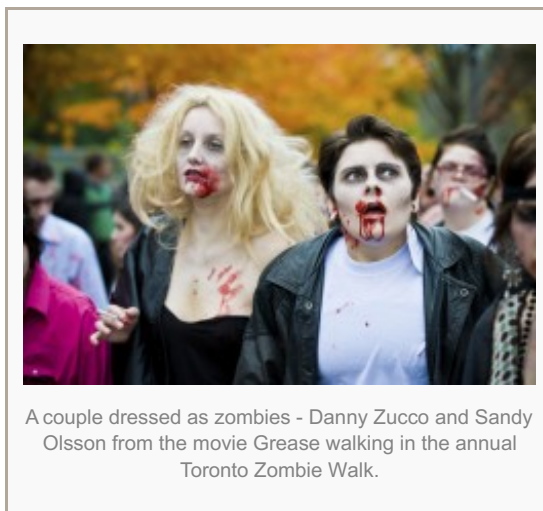
A couple dressed as zombies - Danny Zucco and Sandy Olsson from the movie Grease walking in the annual Toronto Zombie Walk.

So what do you need to do before zombies...or hurricanes or pandemics for example, actually happen? First of all, you should have an emergency kit in your house. This includes things like water, food, and other supplies to get you through the first couple of days before you can locate a zombie-free refugee camp (or in the event of a natural disaster , it will buy you some time until you are able to make your way to an evacuation shelter or utility lines are